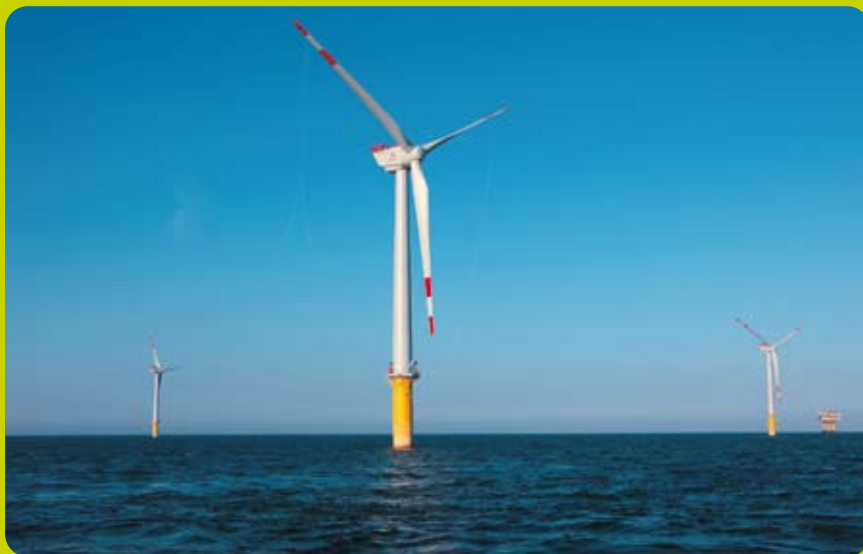
AREVA MultiBrid, 2009.